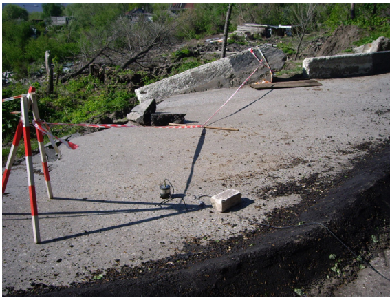
Figure 3. Installation of a mobile system for dynamic and geophysical monitoring of a landslide-prone road section in Ulyanovsk city.

pletion of construction in potentially hazardous areas. The proposed technology of integrated dynamic-geophysical monitoring is a measuring and analytical system (Fig. 2 and Fig. 3), installed in the zone of possible geological hazards and consisting of: a computer with specialized program that allows user to receive and, according to special criteria, process and analyze digital data from sensors installed in the controlled area; multichannel analogue-to-digital converter (ADC); three-component acceleration sensors, tilt sensors, water level and pore pressure sensors; cable or radio channel data transmission system from sensors to ADC. The criteria developed by authors for assessing the stability of a soil mass using the results of dynamic geophysical observations make it possible to determine the onset of unstable soil equilibrium at an early stage from days to several hours. Oscillations are a sensitive parameter of the rigidity of structural systems. Vibrations of the soil mass, as well as structures, depending on its mass and rigidity.