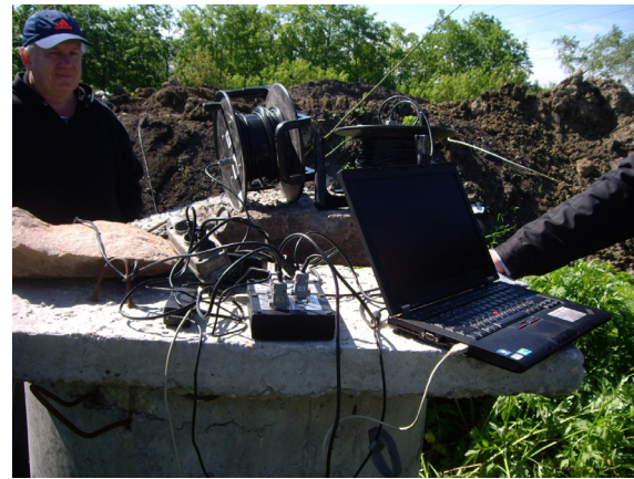
Figure 4. Data collection point for dynamic and geophysical testing of the impact of dynamic and background loads on the soil mass in the construction site area, residential complex under construction and the road at the landslide site.

The solution of the differential equation describing the oscillations of an object of length l (for example, a beam) looks like that [1-3]: