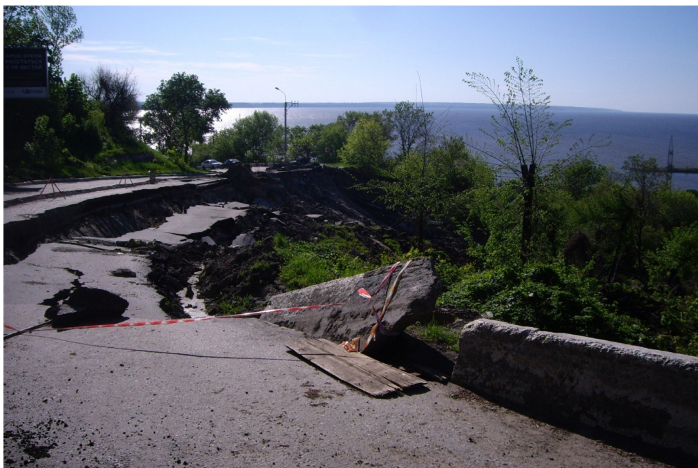
Figure 1. Sliding of the roadbed in Ulyanovsk city due to inefficient drainage and increased vibration from railway transport and heavy vehicles